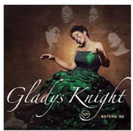
Before Me GLADYS KNIGHT Release Date: October 03, 2006